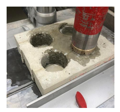
Figure 1. Test specimens preparation process

The test specimens for the extract tests were cylinders with a diameter and a height of 40 \ge 40 mm. The cylinders were drilled from cuboid-shaped cement composite with the dimensions of 160 \ge 140 \ge 40 mm, see Figure 1, 2. The age of the test specimens for the extract test was 28 days.