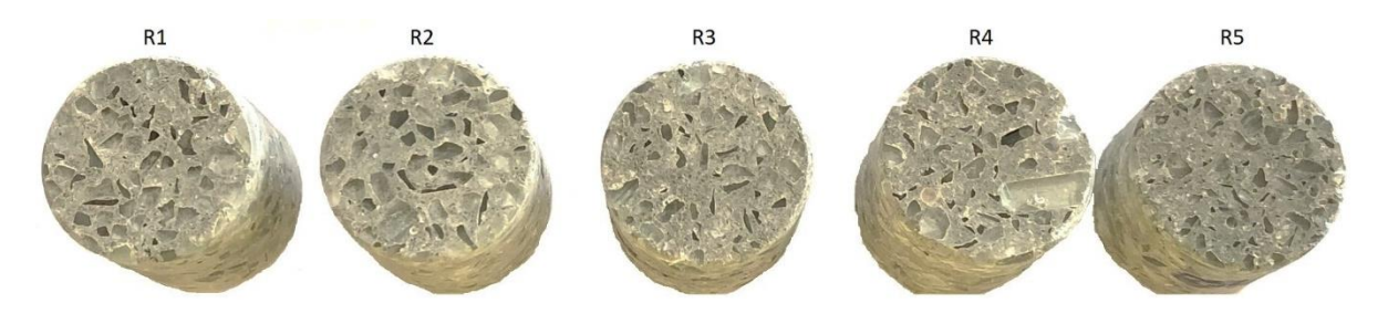
Figure 2. Structure of the test specimens prepared according to formulas R1 to R5

Figure 2 shows the structure of cylinders made according to formulas R1 to R5. The individual formulas differ from one another in the different percentages of the individual recycled glass fractions.